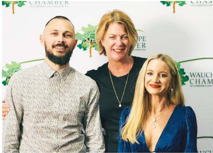
Highly Commended - Baked Culture