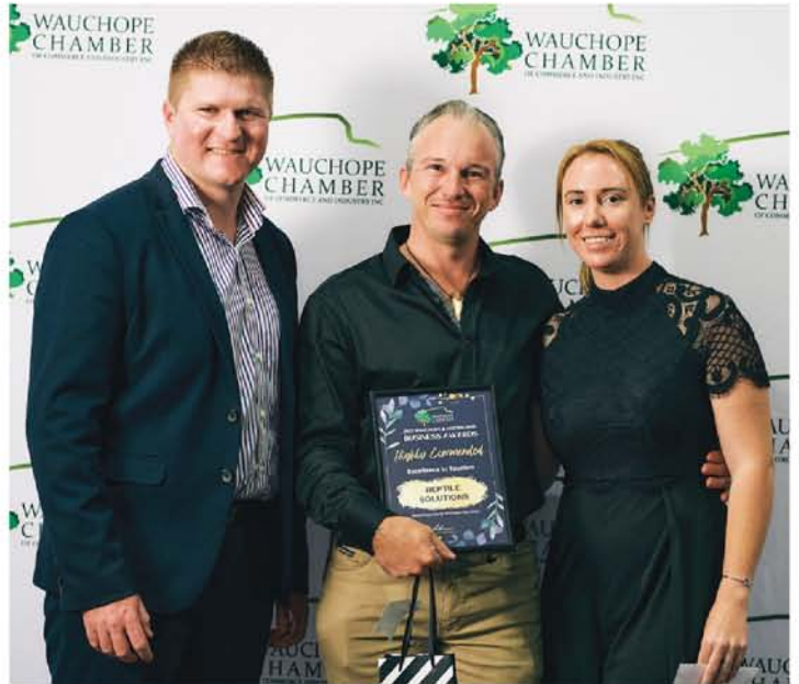
Highly Commended - Reptile Solutions