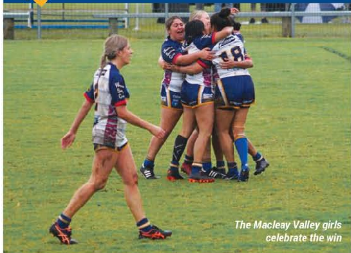
The Macleay Valley girls celebrate the win

The first round of the semi finals were played in wet and windy conditions on Saturday.